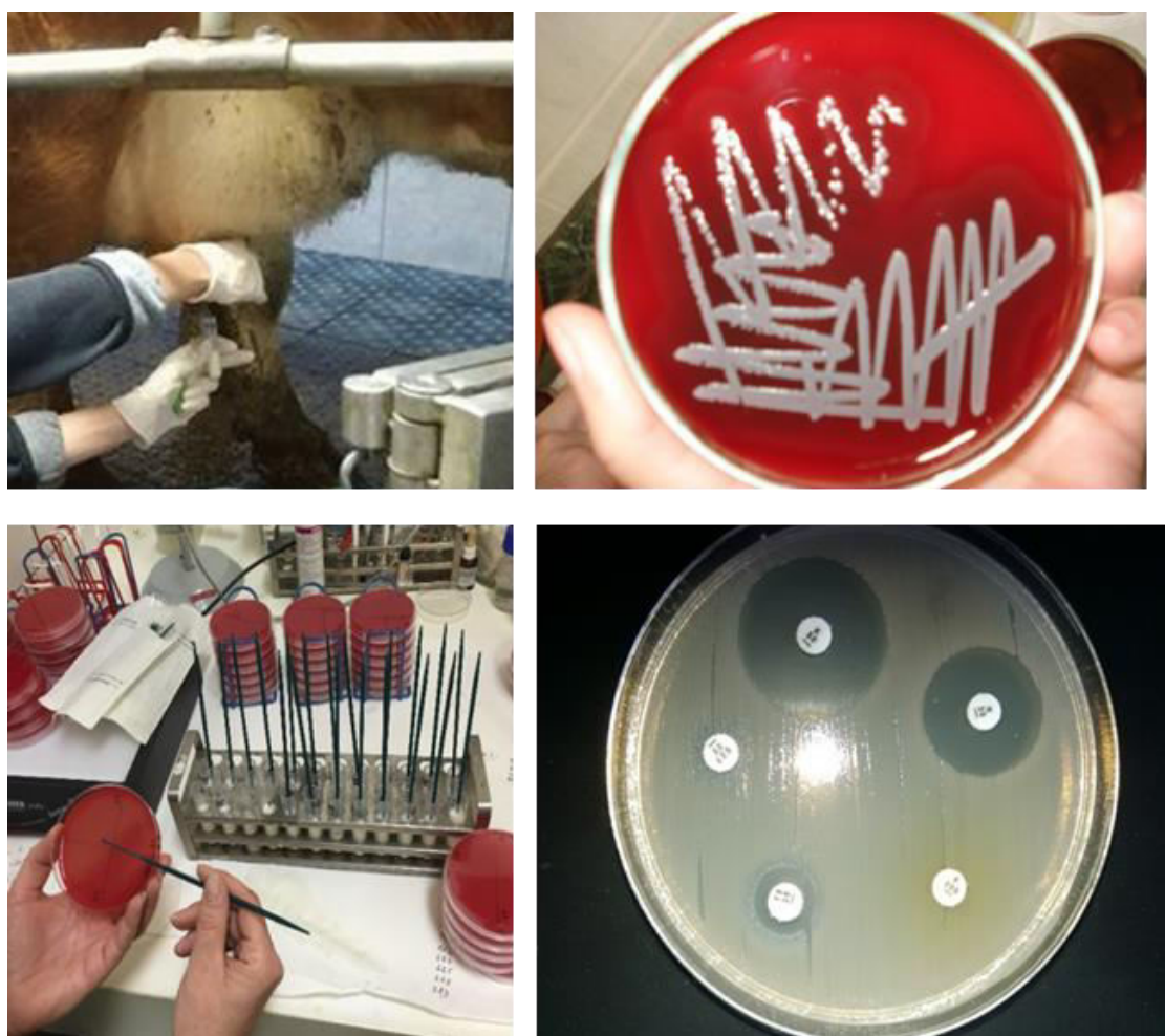
Figure 1 Quarter milk samples collection, bacteriology analysis and antimicrobial susceptibility test by disc diffusion method.

All cows were milked twice daily. The cows from herd A were milked in tandem parlor DeLaval 2x5 (Tumba, Sweden). In parallel parlor Boumatic 2x12 Xpressway (Wisconsin, USA) were milked cows from herd B. The average milk yield ranged from 7300 (herd A) to 7800 l (herd B) per year. Blanket dry cow therapy was implemented in all herds.