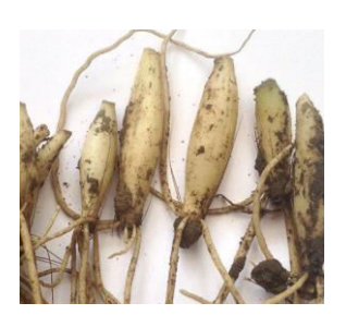
Figure 1 Pictures of garlic bulbs types (left – Czech type Bjetin ( Allium sativum ), middle – Polish type Harnaś ( Allium sativum ), and right – bear's garlic ( Allium ursinum ) (Garlik variety Harnaś, 2018; Registered varieties of winter garlic, 2018; Wild garlic ( Allium ursinum ), 2018).

Results of TAC were calculated from inactivation values using trolox as standard and expressed as trolox equivalents (TE) in mg.100g<sup>-1</sup> sample. Average results were obtained from three parallel determinations.