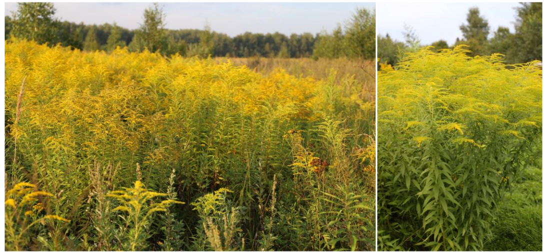
Figure 1 Solidago canadensis L. in the Moscow district, photo by Yu.Vinogradova, September 2016.

Essential oil was obtained from an average sample of aerial parts (leaves, inflorescences and a mixture of inflorescences and leaves) of plants. The oil was extracted from chopped air-dried material by hydrodistillation according to Ginzberg (1932). Qualitative composition of the oil was determined by gas chromatography at the Center for Collective Use of the Federal Research Center "Fundamentals of Biotechnology", Russian Academy of Sciences, Moscow (RFMEFI62114X0002), using a Shimadzu GS 2010 gas chromatograph with a GCMS-OP 2010 mass detector and SPB-1 nonpolar column (solidphase-bound methyl silicone) (Supelco, Sigma-Aldrich Corporation) with the length of 30 m and diameter of 0.25 mm. The samples were dissolved in benzene at a ratio of 1:150 and chromatographed with the temperatureprogramming mode under the following conditions: injector temperature, 180 °C; interface, 205 °C; detector, 200 °C. The carrier gas was helium. The flow through the column was 1 cm<sup>3</sup>/min and flow division was 1 : 10. Mass detector settings: logging mode, TIC; mass range, 30 - 400 m/z. The temperature regime for the substances with the retention index of 1300 consisted of the thermostat at 60 °C for 3 min; then, 2 °C.min<sup>-1</sup> until 230 °C; and isotherm for 2 min. The temperature regime for the substances with a retention index higher than 1300