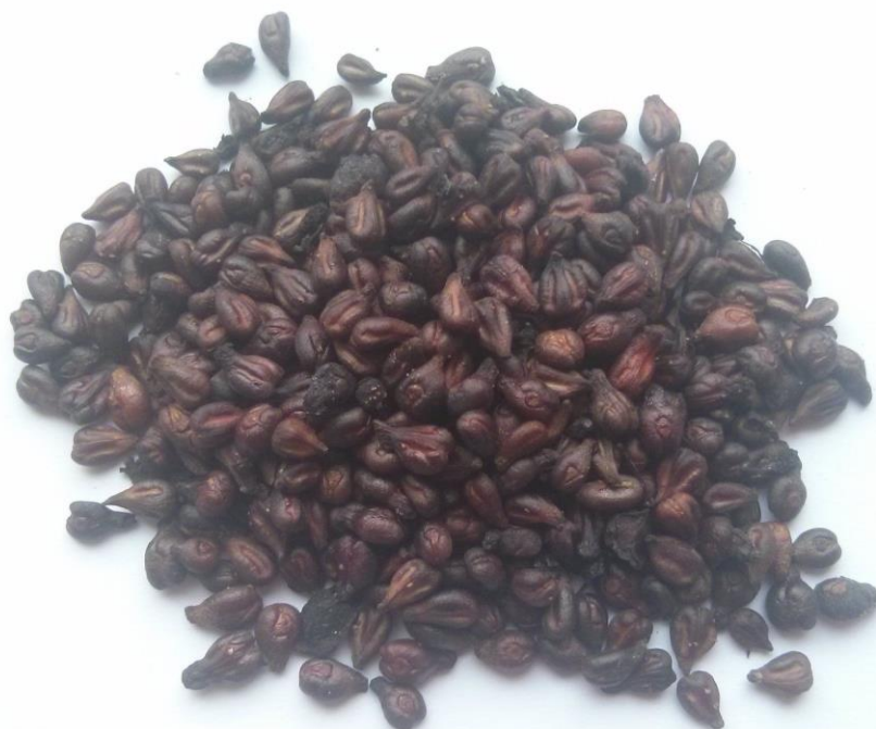
Figure 1 Grape seeds ( Vitis vinifera L., cultivar Marlen).

A 1500 µL volume of the ABTS reagent (7 mM 2,2'-azinobis-3-ethylbenzothiazoline-6-sulfonic acid) and 30 µL of the sample (extract from the grapevine seeds) was pipetted into the cuvette (3 mL). The mixture was incubated at ambient room temperature for 30 minutes. After this time, the absorbance was measured at 734 nm.