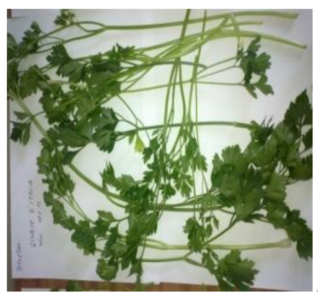
Figure 1 Parsley tops ready for drying.

When evaluating impact of thermal process on vitamin C content (Figure 3), there were high significant differences in case of all observed variants. In fresh herb the values were the highest, and then there was rapid decreasing in frozen herb variant, the lowest values were found in third variant – dried herb. It is in accordance with the results of Roslon et al. (2010) , where they tested leaves from two cultivar varieties of celery: 'Safir' – a leaf variety and 'Jabłkowy' – a celeriac variety. Fresh leaves contained on average 104.90 mg.100 g<sup>-1</sup> of vitamin C. Freezing and drying caused decreasing content of vitamin C in investigated raw material.