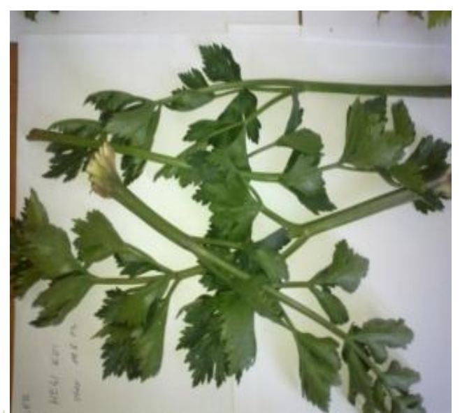
Figure 2 Celery tops ready for drying.