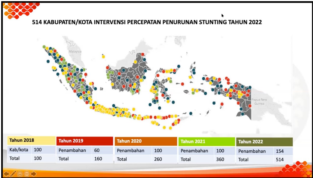
Figure 2 Acceleration of stunting reduction in 514 districts/cities.

According to estimation, stunting will affect 21.3 % or 114 million children under the age of 5 in 2019. This revealed that stunting and malnutrition were indications of undernutrition concerns in Indonesia. Children with malnutrition typically have a decreased appetite. It can be seen by the time they wanted to eat, but for a short while. Therefore, he needs specialized food with a high enough concentration of nutrients and can be easily ingested, even though there is a limited supply of such foods. In general, the calorie content of foods exceeding 1.2 kcal per millilitre is considered excessive. While the standard composition ranges from 0.9 to 1.2 kcal per millilitre of liquid or powder, this formula contains fewer calories. The acceleration of stunting reduction in 514 districts/cities of Indonesia is present in Figure 2.