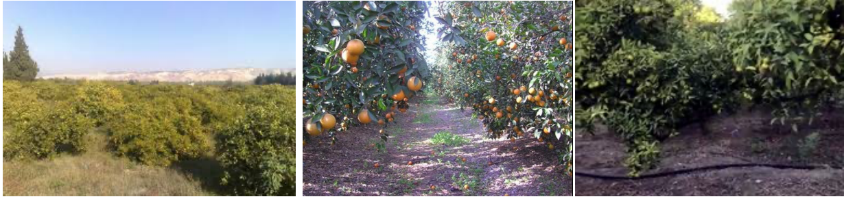
Figure 1 The Northern Ghor of Jordan valley.

through inappropriate network designing and operations (Al-Qinna and Salahat, 2017).