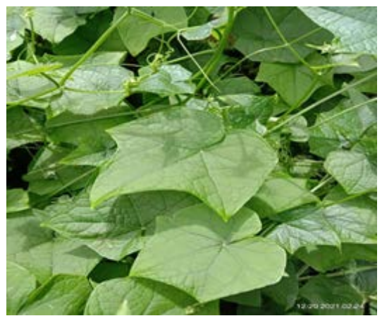
Figure 1 Chayote (Sechium edule) leaves.

This study was a true experimental research design using a randomized pre-post-test control group design. The study was conducted at the Animal Laboratory of PAU, Universitas Gadjah Mada, Yogyakarta for animal care, and Integrated Laboratory of Universitas Diponegoro, Semarang for the production of chayote leaves ( Sechium edule )'s flavonoid fraction. This study had been approved by the Health Research Ethics Commission of the Faculty of Medicine, Universitas Diponegoro Semarang, with the number 05/EC/H/FK-UNDIP/I/2020.