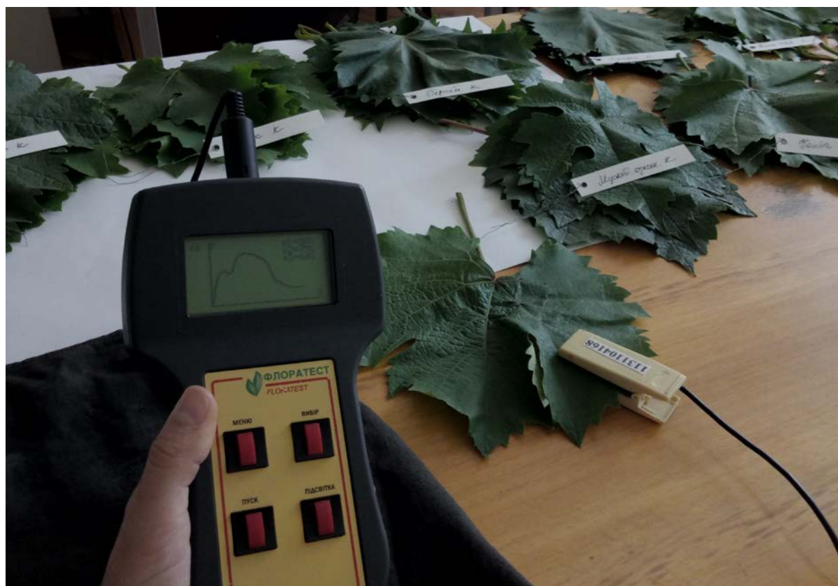
Figure 1 Functional activity research of grape leaves using a portable chronofluorometer "Floratest".

During the assessment of the functional state of the photosynthetic apparatus by inductive changes in chlorophyll fluorescence, a set of parameters was used, which allowed us to analyze the changes in photosynthetic processes in the leaves, namely: