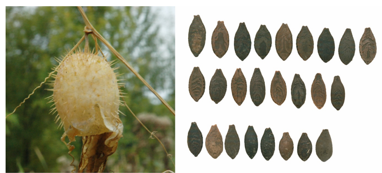
Figure 2 Fruit and seeds of Echinocystis lobata (Mich.) Torr. et Gray (each seed has been collected from single individual).