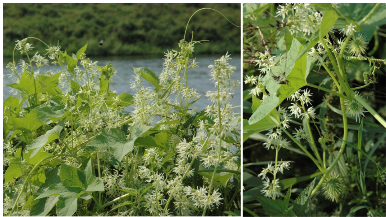
Figure 1 Invasive populations of Echinocystis lobata (Mich.) Torr. et Gray.