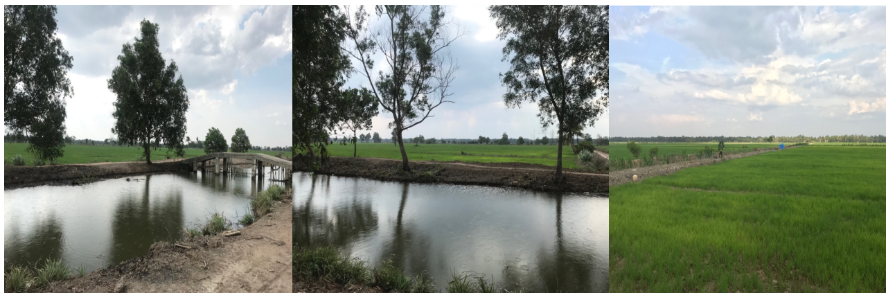
Figure 1 Tidal swamplands in Muara Telang, South Sumatra, Indonesia.

The primary data were collected through face-to-face interviews with the farmers. The 150 farmers were chosen by a simple random sampling technique since the area is similarly affected by tidal water. Some questions regarding the farmers' socioeconomic situation were addressed, i.e., age, education, household size, farm size, and farming experience. This study also covered several agricultural input use information such as seed, fertilizer (nitrogen, phosphor, and potassium), and chemical (herbicide, pesticide, and fungicide).