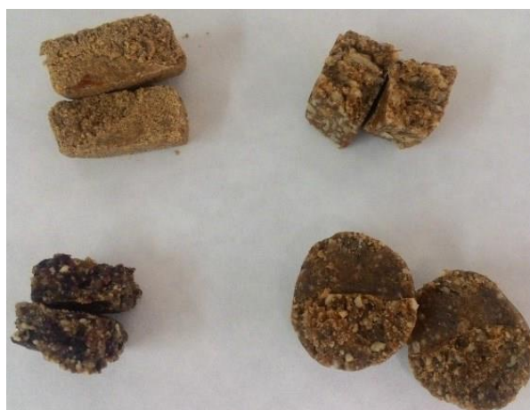
Figure 1 Various types of raw bars. Note: (top left – raw sesame bar, top right – raw stick with cashew, left bottom – raw chocolate florentines, bottom right – raw apple ball).

Ten grams of the fermented raw food sample (Figure 1) was weighed out, aseptically removed and put into 90 mL of sterile physiological solution that was subsequently homogenised for 10 min (using a stomacher). The raw bars were then subjected to routine microbiological analysis. The total microorganism counts were assessed according to ISO 4833-1 (2013), the Enterobacteriaceae bacteria family according to ISO 6611-2 (2017), yeasts and moulds according to ISO 6611 (2004) and halotolerant microorganisms (staphylococci) according to Chapman (1945) on mannitol salt phenol red agar after cultivation at 37 °C for 2 days. The selected colonies were isolated into BHI broth and cultivated for 24 – 48 h at 25 °C (yeasts), 37 °C ( Enterobacteriaceae , Staphylococcus ) or 30 °C (other microorganisms). Each raw bar product sample was microbially analysed 3 times. Identification of the microorganisms was performed via the MALDI-TOF MS method using a Bruker Autoflex Speed (Bruker Daltonics, Bremen, Germany) and the Biotyper 3.1 database (Bruker Daltonics) after preliminary classification of isolates into individual microorganism groups. Visualisation of the protein profiles was performed via mMass 5 (Strohalm et al., 2010). The individual identifications were performed in at least two independent experiments in two parallels (Pleva et al., 2018).