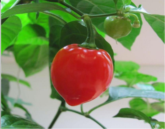
Figure 5 Habanero Red Savina.