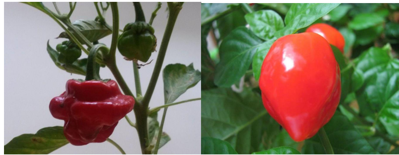
Figure 6 Habanero Red Savina 1.

Once the fruit had matured on the plants in the field, a single harvest of 25 random mature fruits from at least 10 plants in each replication was bulked. After harvest, the sample was dried and ground. The extraction of the capsaicinoids and the estimation of capsaicinoid amounts followed the high performance liquid chromatography (HPLC) procedures for the short run method as described by Collins et al. (1995) . The HPLC data were converted