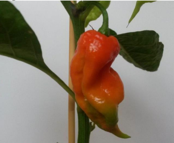
Figure 4 Bhut Jolokia.