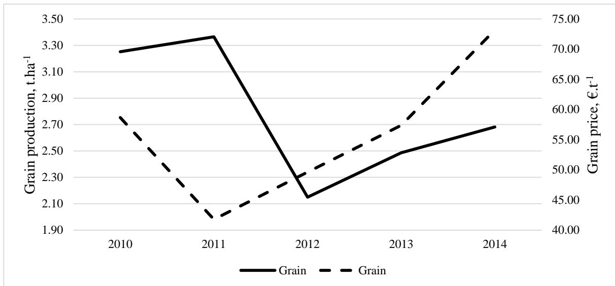
Figure 1 Grain production and price in Orel region.