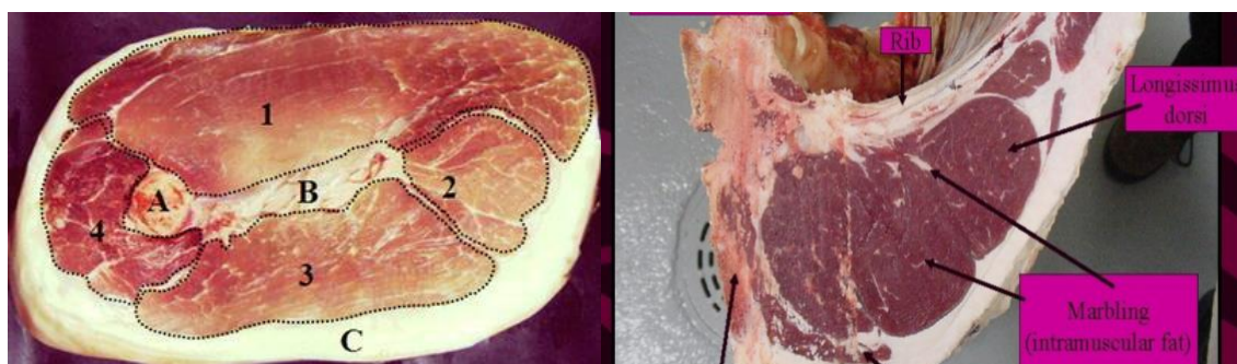
Figure 1 Beef thigh and roast beef muscles used in research. Note: Thigh muscle in cross-section: 1. musculus semimembranosus ; 2. m. semitendinosus ; 3. m. biceps femoris ; 4. m. rectus femoris a m. vastus medialis ( m. quadriceps femoris ) [6], Roast beef in cross-section: rib; m. longissimus dorsi , marbling (intramuscular fat) [7].

Thigh and roast beef from young cattle were sampled and bred in a herd with another 24 pieces of cattle in the free-range system. The young cattle in the fattening ward received a stable feed ration of corn, alfalfa silage, barley straw, and meadow hay, supplemented with a supplementary core mixture during sampling. Thigh and roast beef were transported from the farm to the Institute of Animal Husbandry (Department of Veterinary Disciplines) of the Faculty of Agrobiological and Food Resources, the Slovak University of Agriculture in Nitra, where the muscles were anatomically separated.