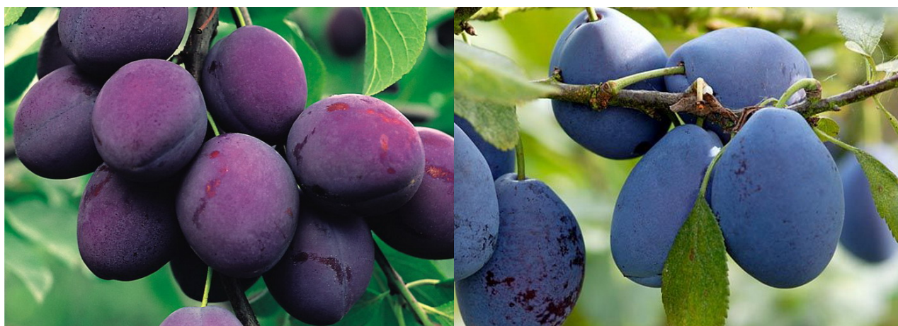
Figure 2 The plums included in the study ( Prunus domestica ).

This way, 24.1 liters of product were obtained during pot-still distillation and 23.5 liters using the tower technology. Analytical tests were performed in February 2019, while sensory evaluations took place in October 2019, when the plum palinka was 1 year old.