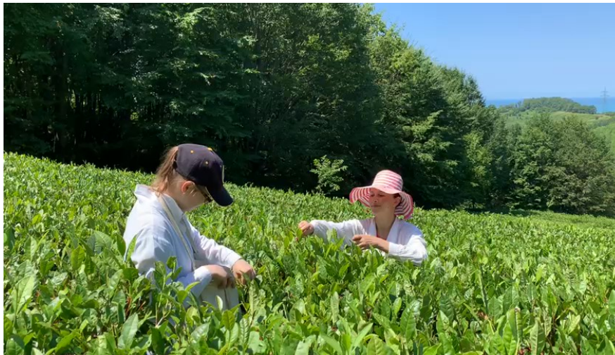
Figure 3 Tea harvesting on an experimental plantation (Sochi, Russia).