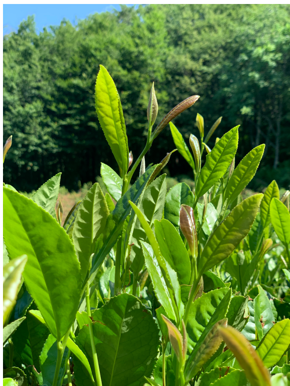
Figure 1 Tea sprout.