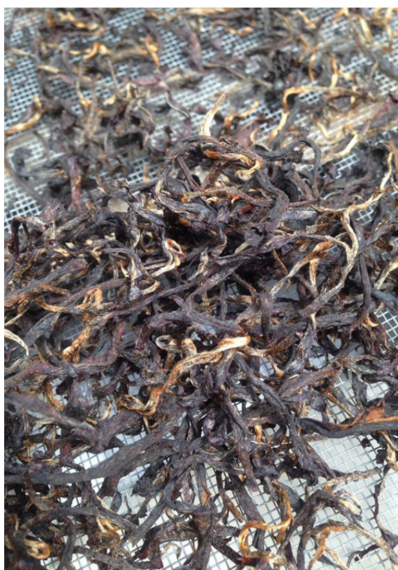
Figure 2 Black tea from Krasnodar sprout.

We performed a correlation analysis that showed a direct relationship between increased enzyme activity and hydrothermal factors (Table 2). At the same time, the most significant correlation was found between the activity of GPO in freshly harvested 3-leaf tea flushes and the amount of precipitation ( r = 0.86 ).