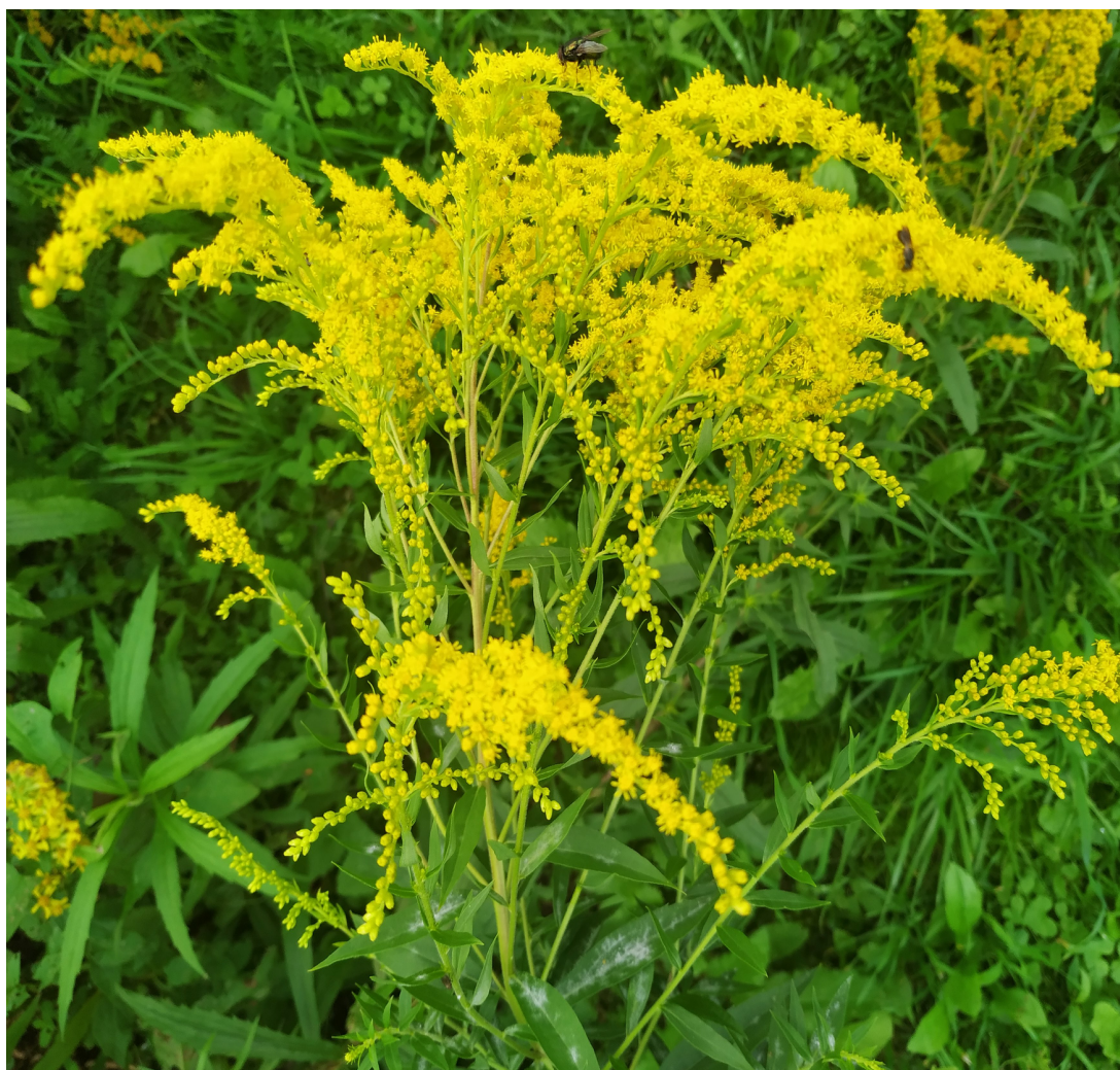
Figure 1 Solidago canadensis L.

The population nearby Nitra city, Slovakia, has been observed. The population of Solidago canadensis (Figure 1) is very dense and occupies a large area. Thus, there is no shortage of this plant as a biological resource. Material has been dried in the shade, at a temperature of 20 – 30 °C. Because of our earlier studies proved the minimal concentration of functional ingredients in stems (Shelepova et al., 2019), only leaves and inflorescences have been taken for analysis.