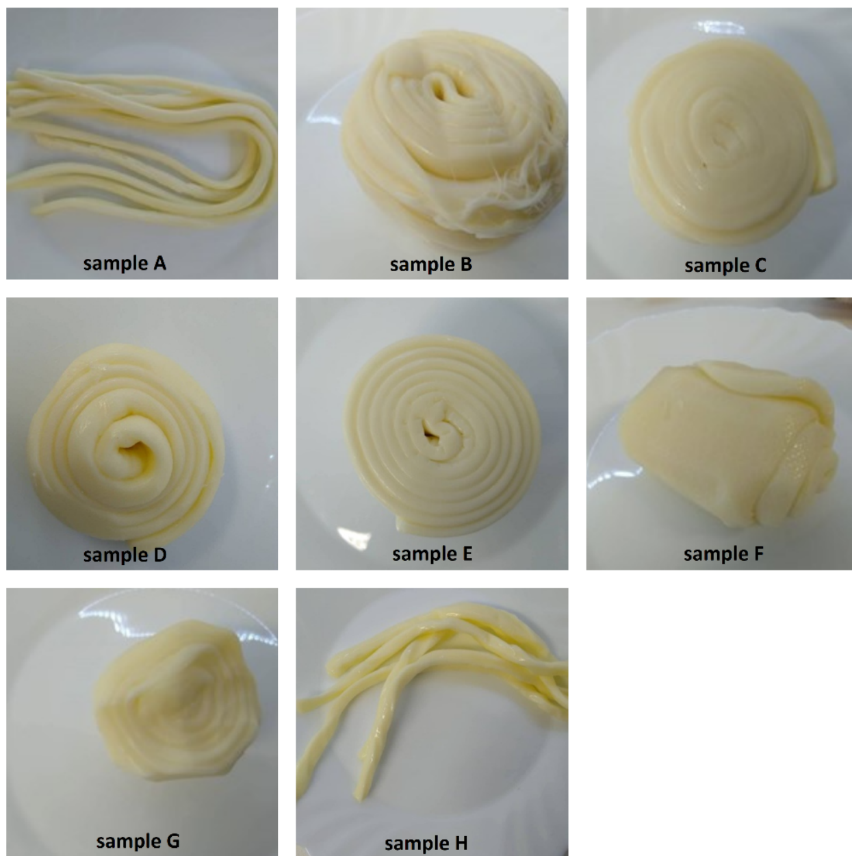
Figure 1 Samples (A – H) of unsmoked steamed cheeses.